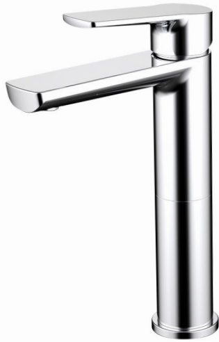
Product images are for illustration purposes only. Actual product(s) may vary.