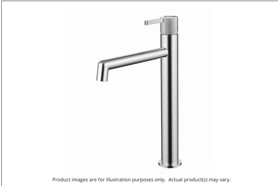
Product images are for illustration purposes only. Actual product(s) may vary.