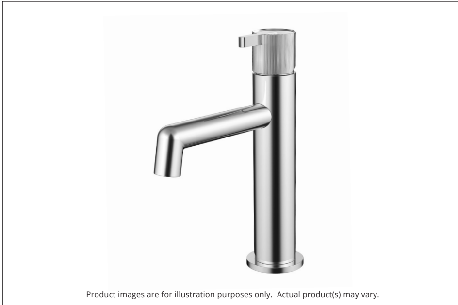
Product images are for illustration purposes only. Actual product(s) may vary.