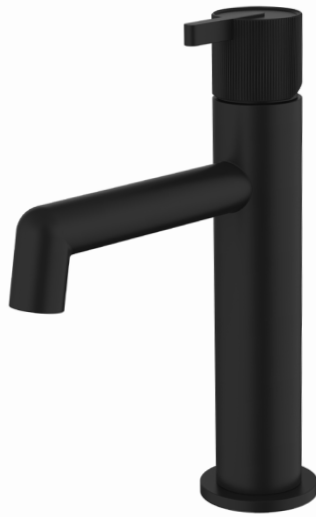
Product images are for illustration purposes only. Actual product(s) may vary.