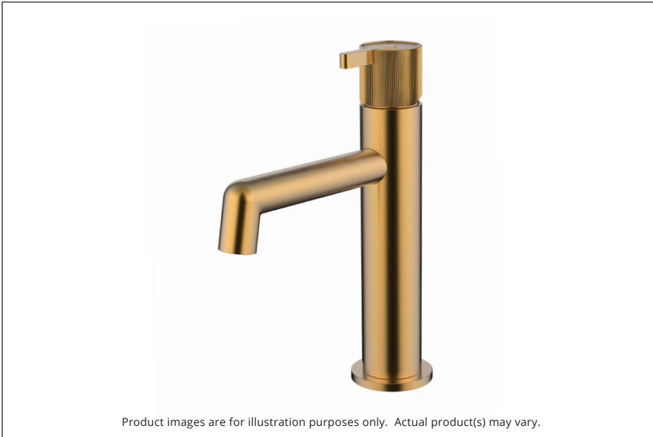
Product images are for illustration purposes only. Actual product(s) may vary.