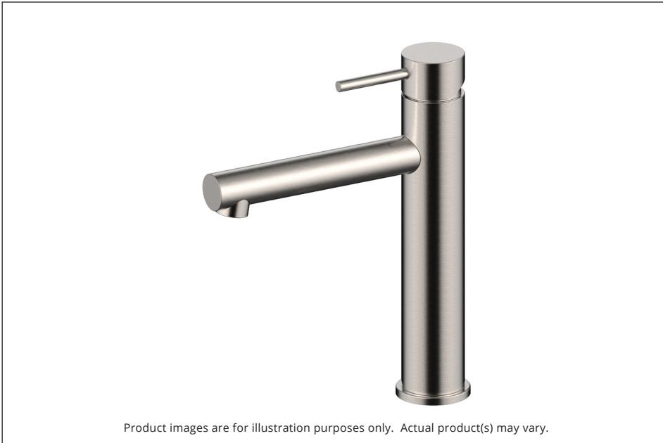
Product images are for illustration purposes only. Actual product(s) may vary.