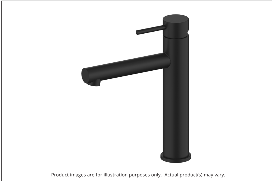
Product images are for illustration purposes only. Actual product(s) may vary.