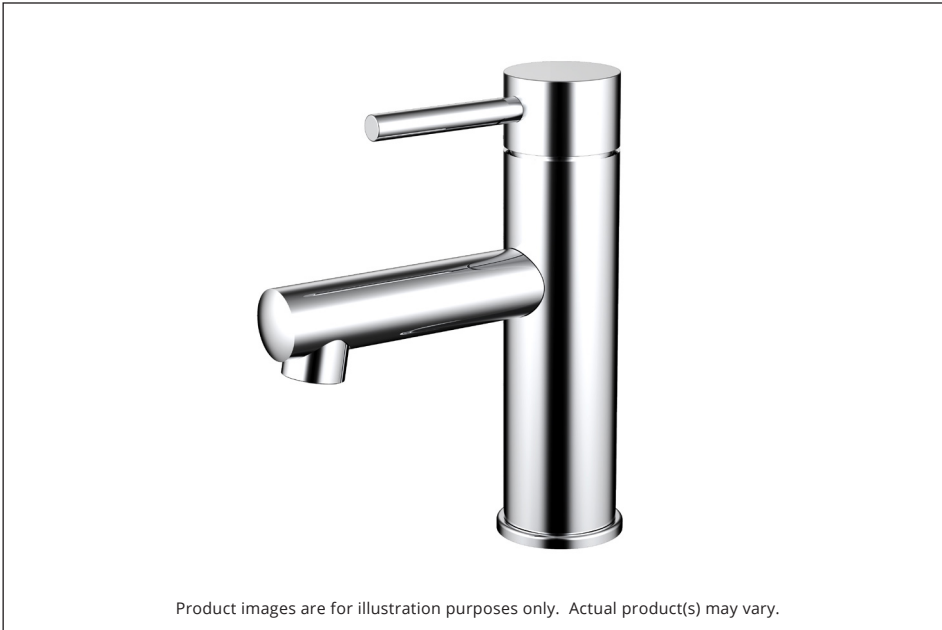
Product images are for illustration purposes only. Actual product(s) may vary.