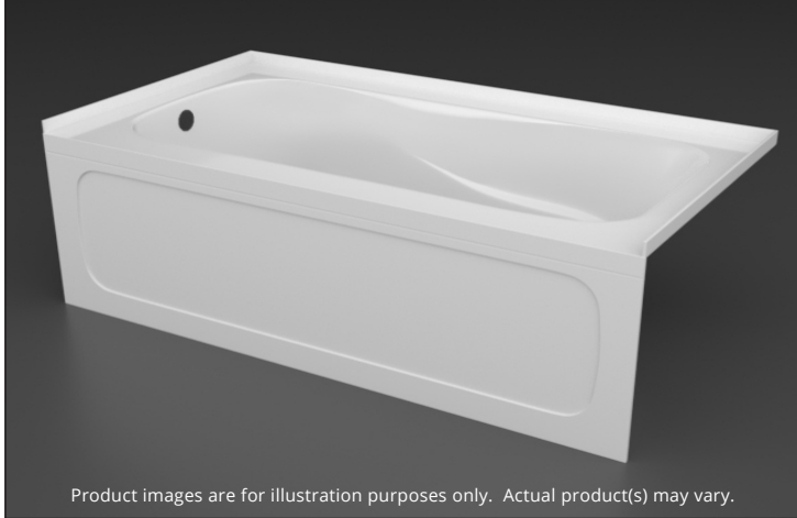
Product images are for illustration purposes only. Actual product(s) may vary.