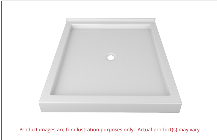
Product images are for illustration purposes only. Actual product(s) may vary.