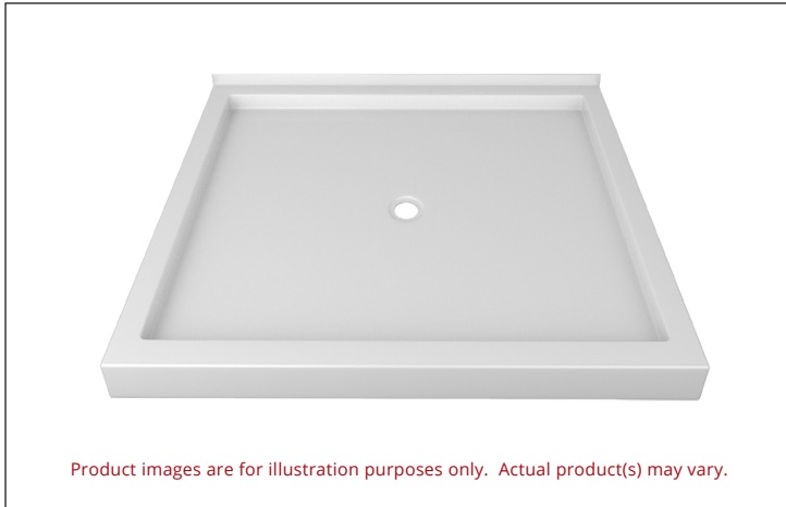
Product images are for illustration purposes only. Actual product(s) may vary.